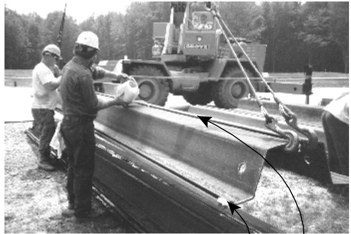
Figure # 1

One gallon of A-30 will treat approximately 140' - 150' of this interlock.